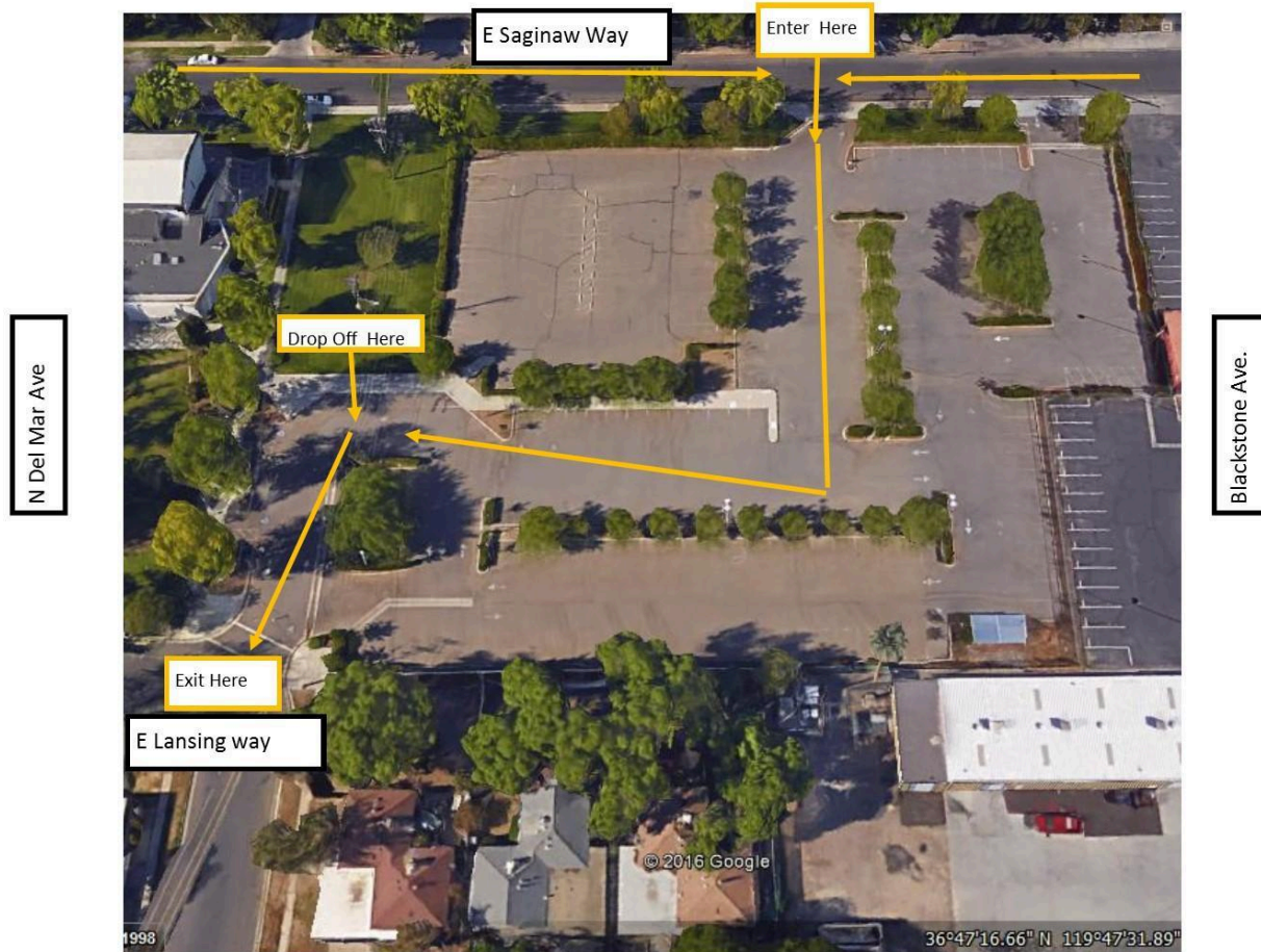
Aspen Public School Parking Map Drop Off/Pick Up 1st and 2nd Grade

*Kindergarten Pick Up/Drop Off located off E Saginaw Way