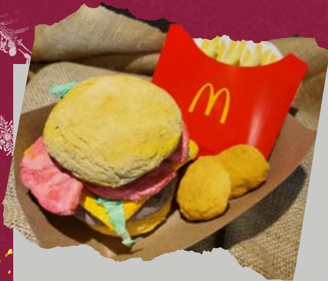
Food art made with tissues