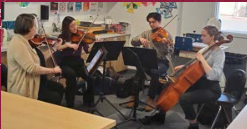
The Tower String Quartet visits Aspen Ridge on December 6th, 2023